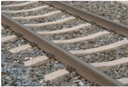
Ballasted Track (32.9 Tkm)

The Metro Express Project's requirement include three types of rail tracks for its 26 Km alignment: