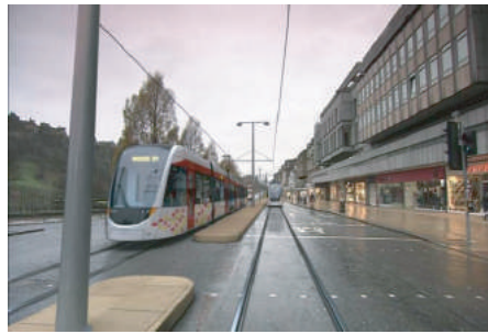
Embedded Track (13.3 Tkm)