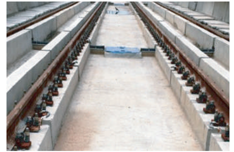
Plinth Track (8.6 Tkm)