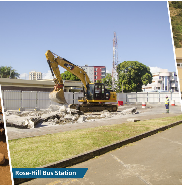
Rose-Hill Bus Station