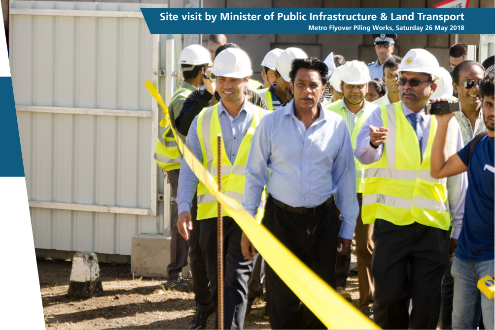
Site visit by Minister of Public Infrastructure & Land Transport Metro Flyover Piling Works, Saturday 26 May 2018