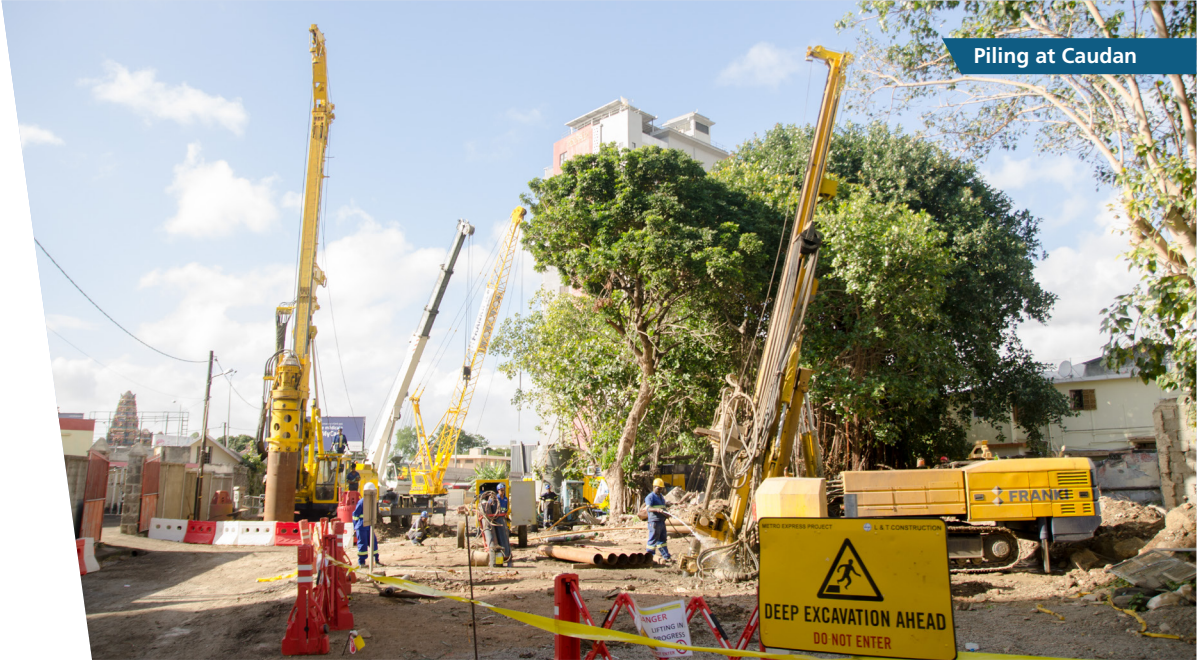
Piling at Caudan