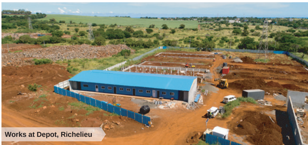
Works at Depot, Richelieu