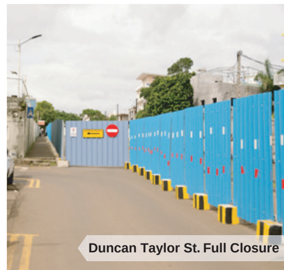
Duncan Taylor St. Full Closure

Exhibition Mock-up of Metro Express LRV Conference Room, Plaza Building 25 Apr - 05 May Mon to Fri, 9a.m. - 4p.m. & Sat 9a.m. - 12p.m.