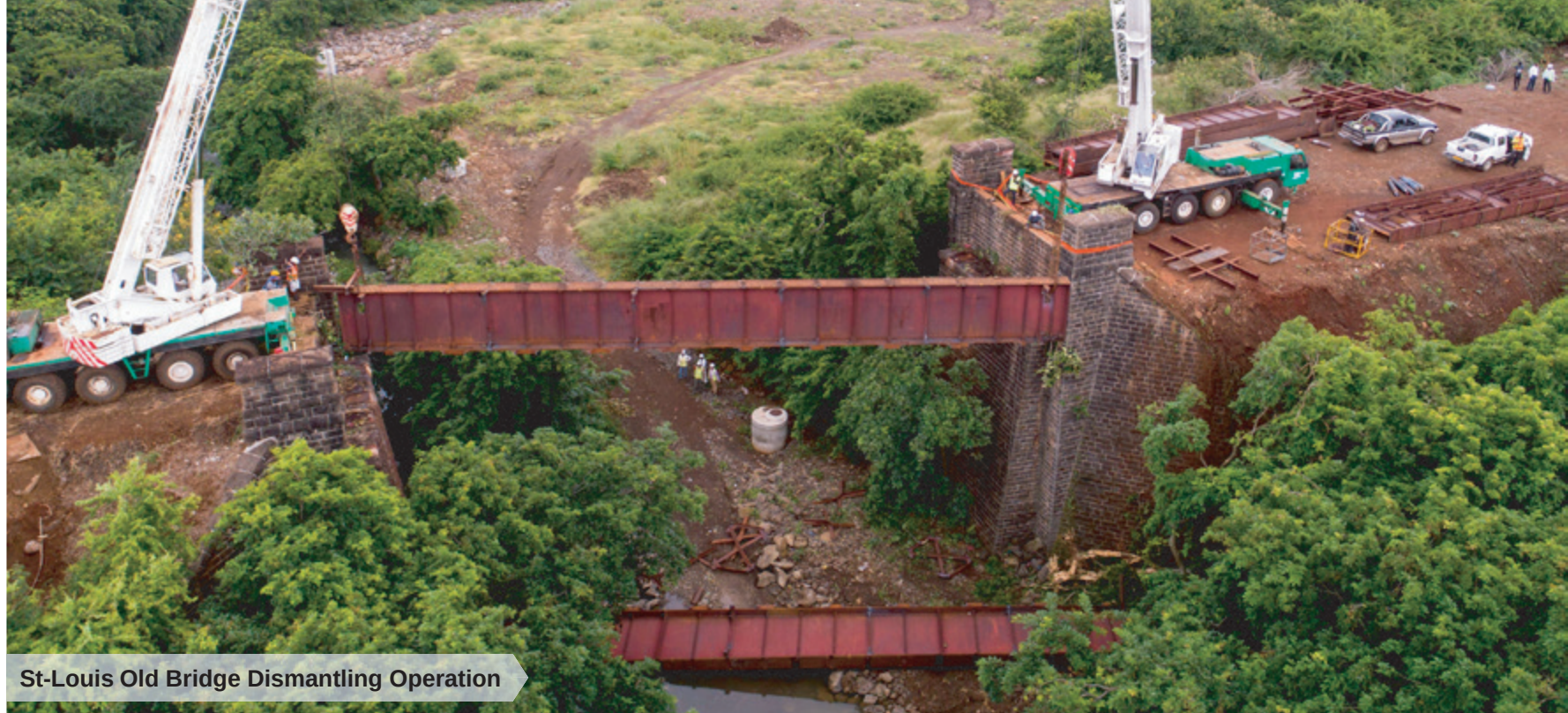
St-Louis Old Bridge Dismantling Operation