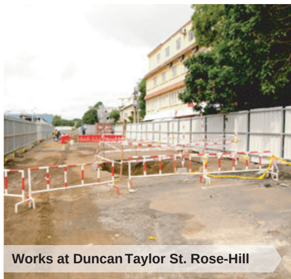
Works at Duncan Taylor St. Rose-Hill